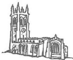
St. Michael and All Angels