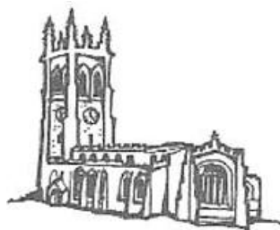
St. Michael and All Angels