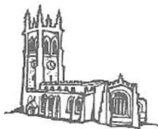
St. Michael and All Angels